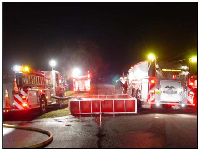
Drafting operations from a portable water tank for water supply.