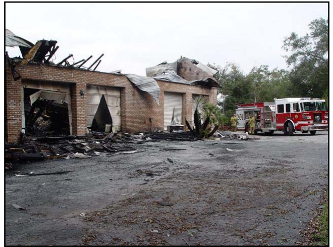
It was in the afternoon when Engine 201 extinguished the final wisps of smoke and fire.